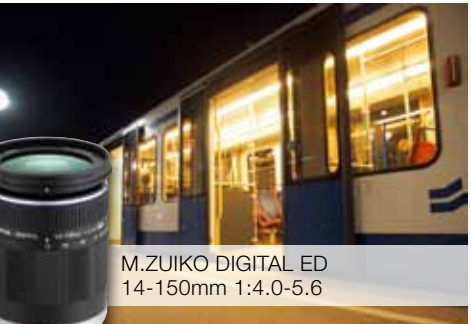
M.ZUIKO DIGITAL ED 14-150mm 1:4.0-5.6