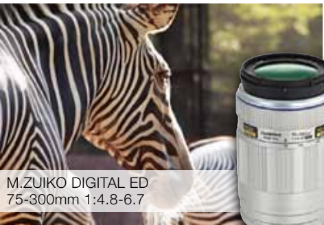
M.ZUIKO DIGITAL ED 75-300mm 1:4.8-6.7