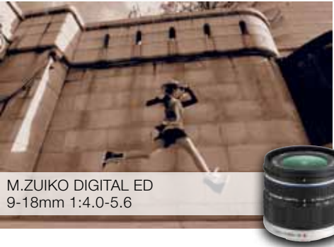
M.ZUIKO DIGITAL ED 9-18mm 1:4.0-5.6

Attach this accessory flash in seconds. It's just as quick to detach, so no extra weight the rest of the time. You'll find it included when you open the box to your new PEN.