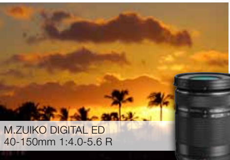
M.ZUIKO DIGITAL ED 40-150mm 1:4.0-5.6 R