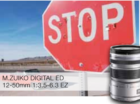
M.ZUIKO DIGITAL ED 12-50mm 1:3.5-6.3 EZ