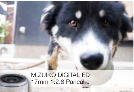
M.ZUIKO DIGITAL ED 17mm 1:2.8 Pancake