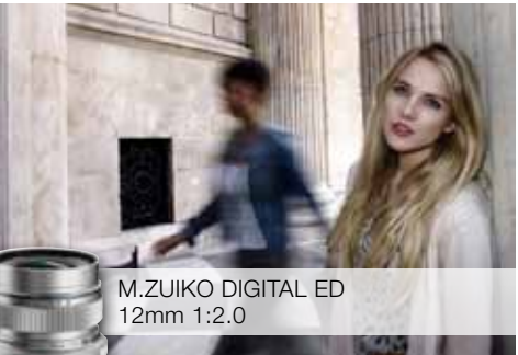
M.ZUIKO DIGITAL ED 12mm 1:2.0