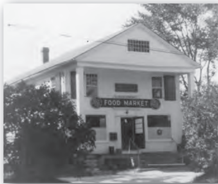
The general store in Goshen, Connecticut

of the theater. Their fascination was mutual, and they were married in 1946. In 1947, their first child, my mother, was born, and a year later the new parents made the radical decision to abandon the demands of life in the theater “forever” in favor of a more conventional family life. They bought a house they called Crosswicks in rural Connecticut, ran the local general store, and raised their family. Looking back, I am not sure they were well suited or prepared for this new life. In fact, the next ten years proved to be difficult and painful for my grandmother. Leaving the spark and energy of New York City and the stimulation of the theater for life in a small town with