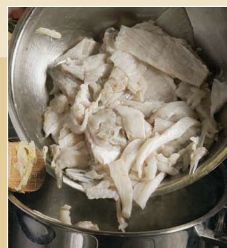
3 Add the drained fish.