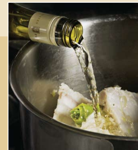
5 Add the white wine.