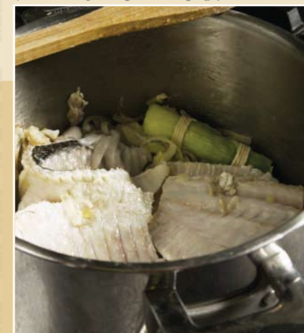
4 Stir well and cook the fish until it begins to firm up.