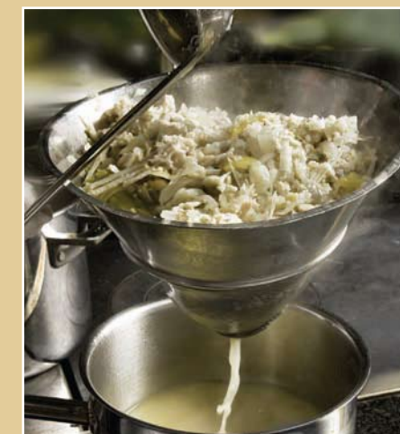
8 Strain, tapping well to recuperate the maximum amount of liquid without pressing.