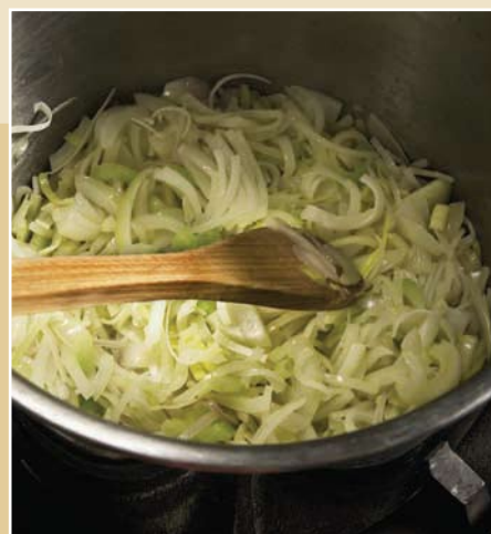
2 Sweat the onions and shallots, once they begin to soften, add the celery and leek. Add the bouquet garni and stir well.