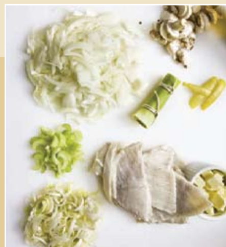
1 Prepare ingredients.