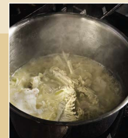
6 Bring to a boil and skim.