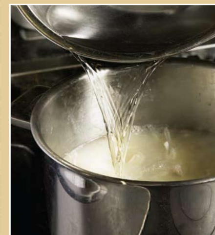
7 Add cold water and stir well.