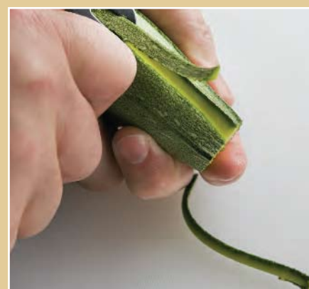
5 Continue to the other end, cutting as straight as possible.