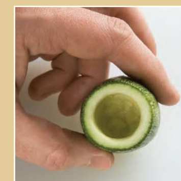
4 Do not scoop too far, there should be at least 1 cm of flesh at the bottom.