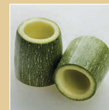
5 Zucchini are now ready for filling.