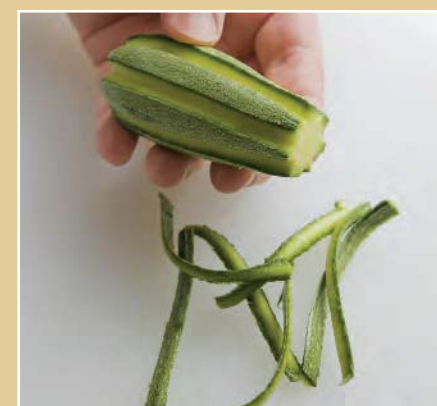
6 Continue around the zucchini.