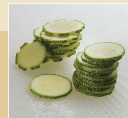
8 Zucchini Canneler Émincer