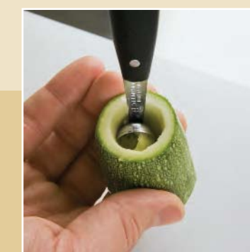
3 Continue scooping, keeping the walls even.