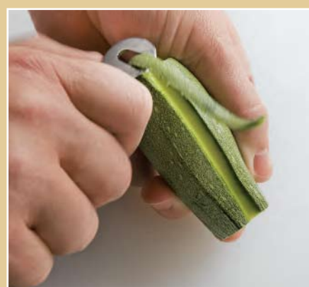
4 Firmly pull toward you.