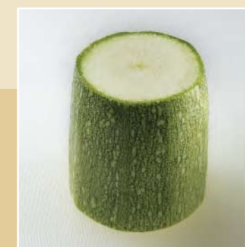
1 Cut whole zucchini to desired length.