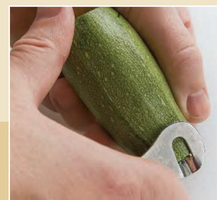
3 Holding it firmly, place the tooth of the channeling knife at the cut end.