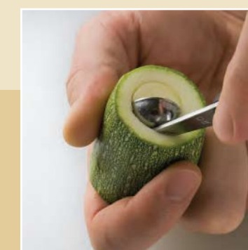
2 Using a melon baller, carefully scoop out the flesh leaving a 3-4 mm border.