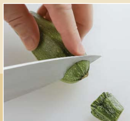
2 Trim off the ends of the zucchini.